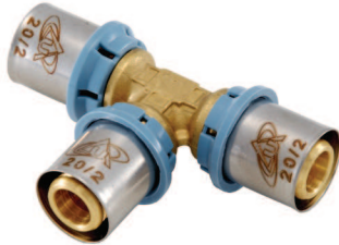
TI A 90° 90° TEE